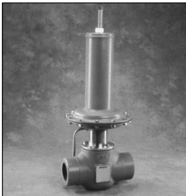
Series 507 Back Pressure Valve