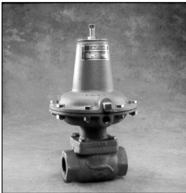
Series 468 Single Port Valve, Ductile Body