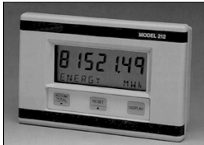
Model 212 Heat Calculator

Mounting is either by a wall bracket or by panel mount.