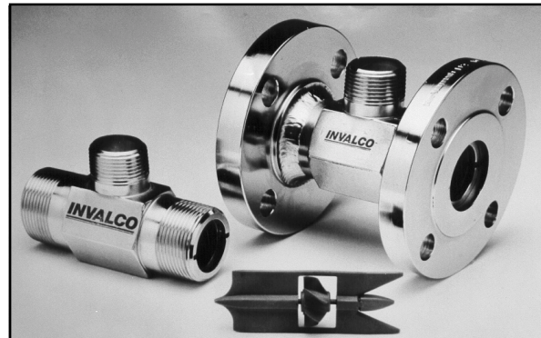
General Purpose 1% WG Series Cartridge Style Turbine Meter