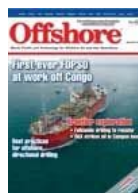
Table of Contents Past Issues