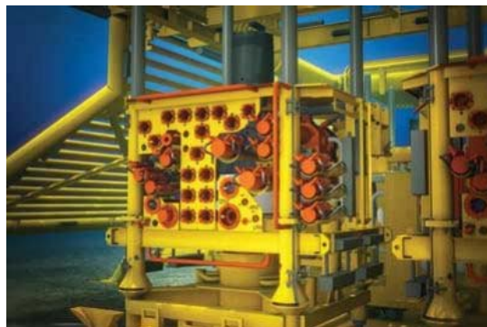
Tyrhans electric tree (artist impression).

This also is backward compatible with hydraulically powered systems so adding new wells to an existing field is straightforward from a controls perspective. No hydraulic infrastructure is required to operate these systems and they feature the same topside communication as a conventional control system.