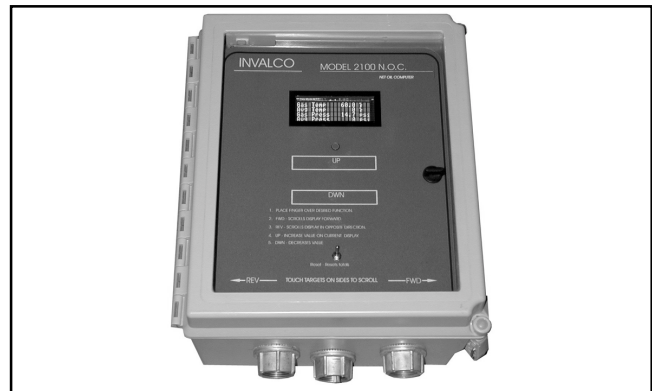
Model 2100 Net Oil Computer