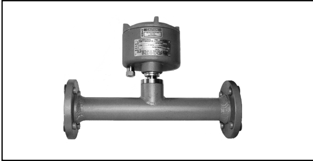
Model CX-545 Capacitance Probe